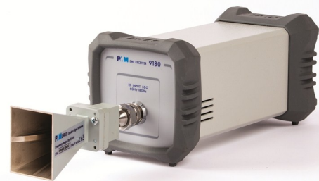
DR-01 installed on EMI Receiver PMM 9180