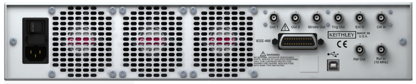
Model 3402-R, Dual-Channel with Rear Outputs