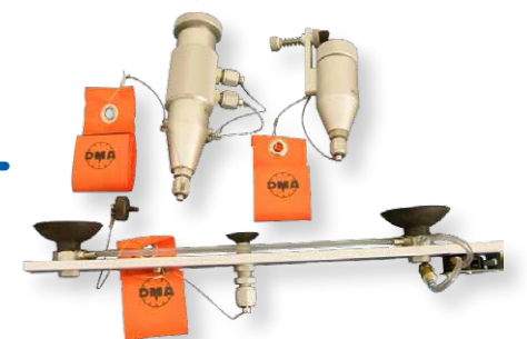
A wide range of pitot-static adaptors and adaptor kits are available from DMA