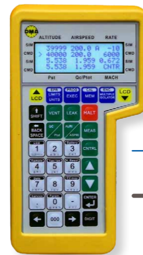
Optional Touch Screen Remote Control. Includes USB port for test program storage on USB memory

Numerous preset factory or user programmed safe limits are provided to prevent damage to the UUT. These limits can be modified by the user either temporarily or permanently, with password protection if desired.