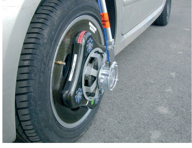
Fig. 1: Out-board transmission module on the RoaDyn® S625 System 2000 measuring wheel