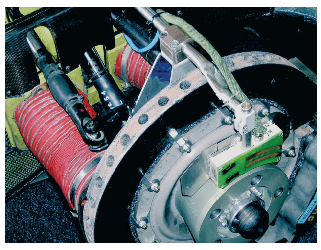
Fig. 2: Stator mounted on vehicle

The rotor is connected to the measuring wheel in the factory. It fits the different geometric configurations and wheels of three available diameters. The stator can be used for all 3 rotor sizes and is mounted on the wheel mounting or the shock strut unit, or in some other suitable location around the hub. The gage Type Z39911 for RoaDyn® S6xy and Type Z17019-10 for RoaDyn P6xy are available for accurate positioning and alignment. The stator is connected to the on-board electronics Type 9891A... using the extension cable Type Z30430A..., which is available in various lengths. The remote control unit is connected to the MDSP card via a D-Sub connector.